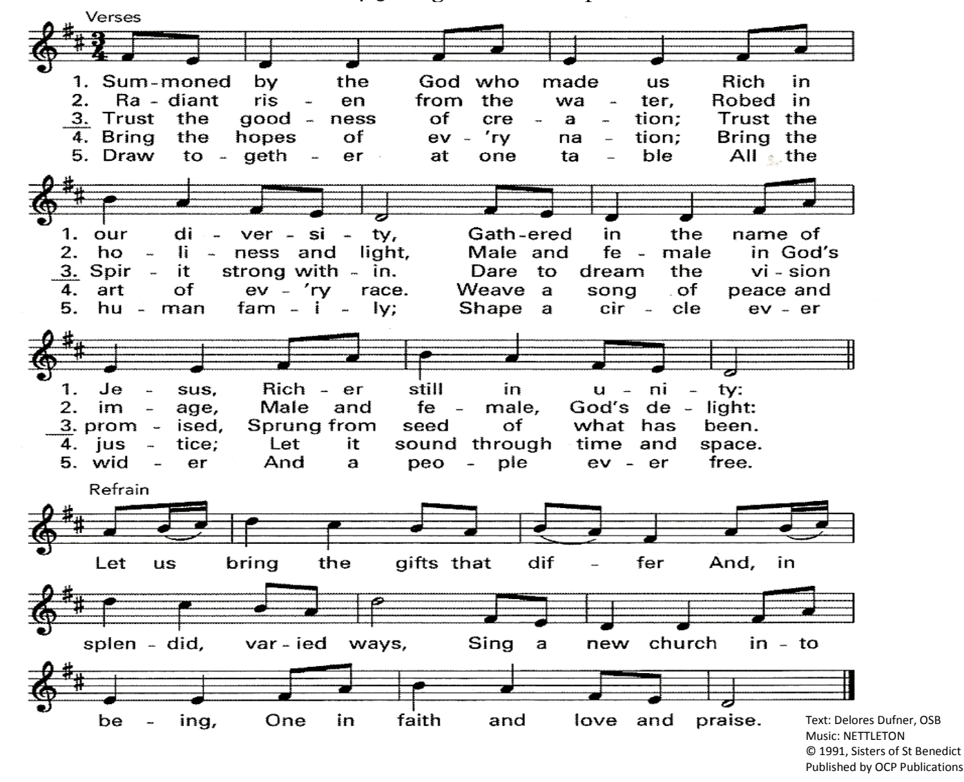
Sing a New Church Verses 1-3 sung before the Gospel Verses 4-5 sung after the Gospel