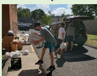
Thrift Store Back to School